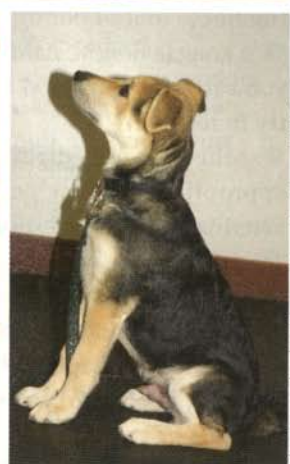
Photographed at Puppy People, Thornhill, Ont.